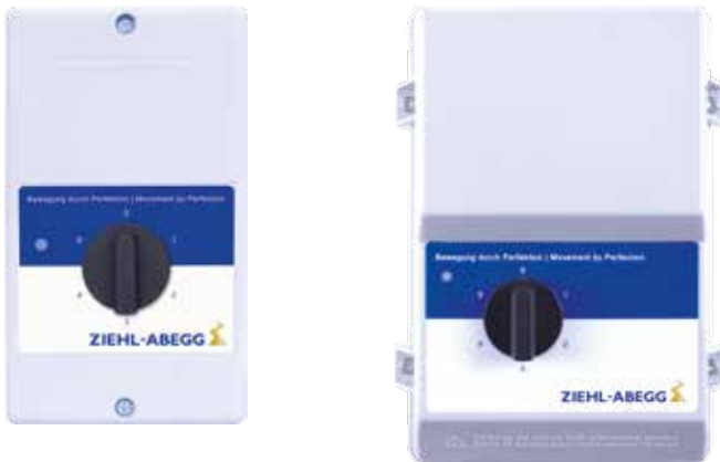
Tranformer based controllers 1~ with 5- step-switch 1~ 230V 50/60Hz